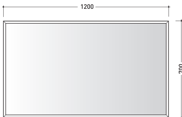
vista frontale / frontal view